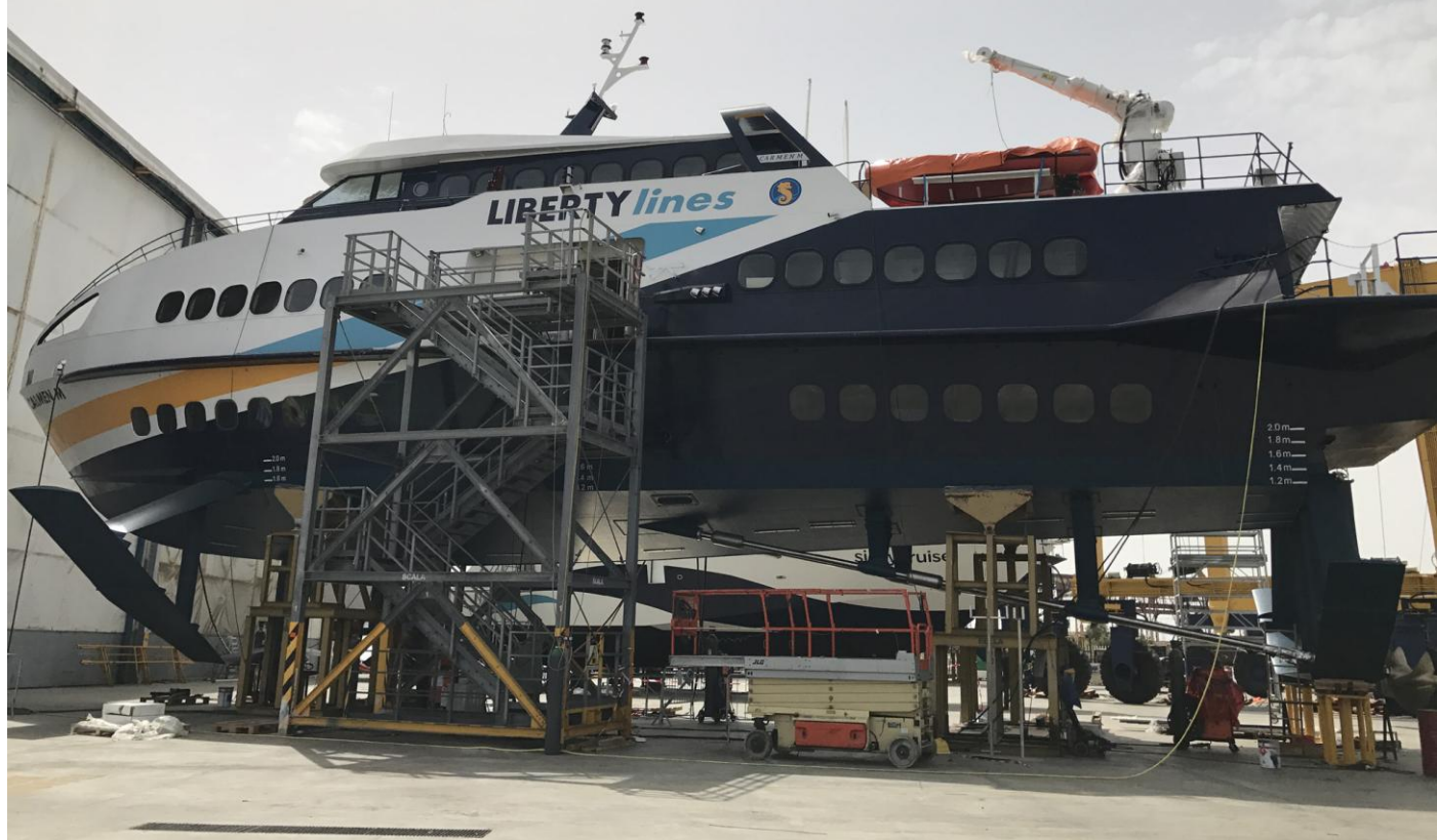
The third 32m Admiral 250 hydrofoil completed, Carmen M, at the Trapani shipyard earlier this month

LIBERTY SHIPYARD in north-western Sicily is currently putting the finishing touch to its third Admiral 250 hydrofoil, Carmen M . The first of the 32m design, Carlo Morace , entered service with Ustica Lines, now known as Liberty Lines, in 2014. A second, Ammari' , was launched the following year.